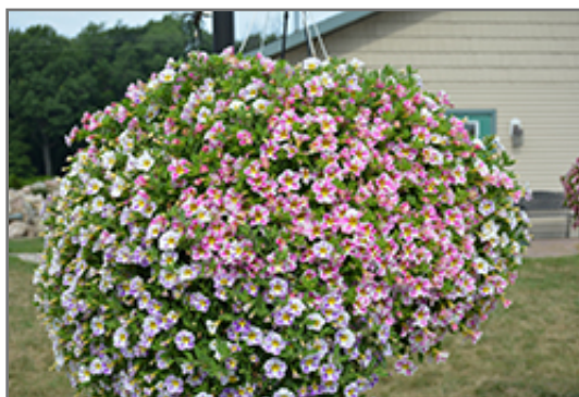
Candy Shop Pixie Stix Mix Calibrachoa in bloom