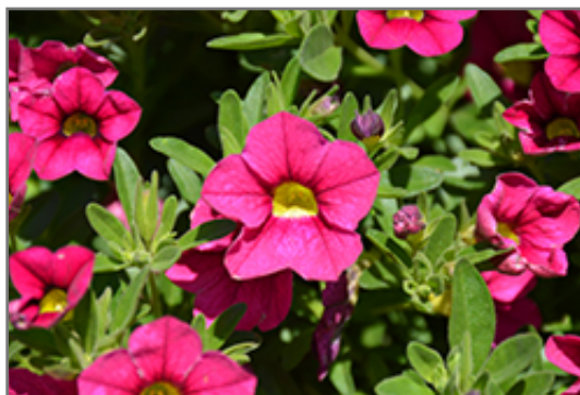
Calitastic Fancy Fuchsia Calibrachoa flowers