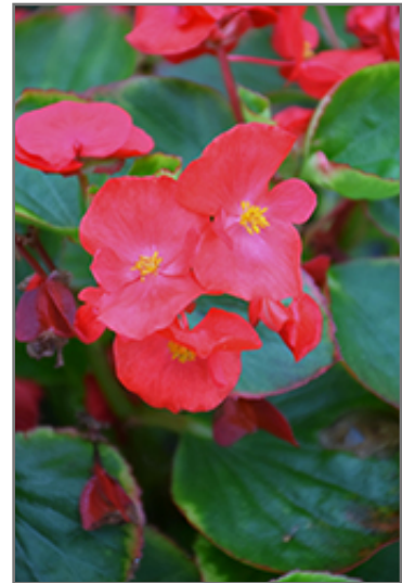
Volumia Scarlet Begonia flowers

Volumia Scarlet Begonia is recommended for the following landscape applications;