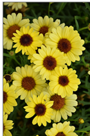
Grandaisy Yellow Daisy flowers

Grandaisy Yellow Daisy is recommended for the following landscape applications;