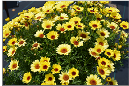
Grandaisy Yellow Daisy in bloom

Grandaisy Yellow Daisy is a fine choice for the garden, but it is also a good selection for planting in outdoor containers and hanging baskets. With its upright habit of growth, it is best suited for use as a 'thriller' in the 'spiller-thriller-filler' container combination; plant it near the center of the pot, surrounded by smaller plants and those that spill over the edges. Note that when growing plants in outdoor containers and baskets, they may require more frequent waterings than they would in the yard or garden.