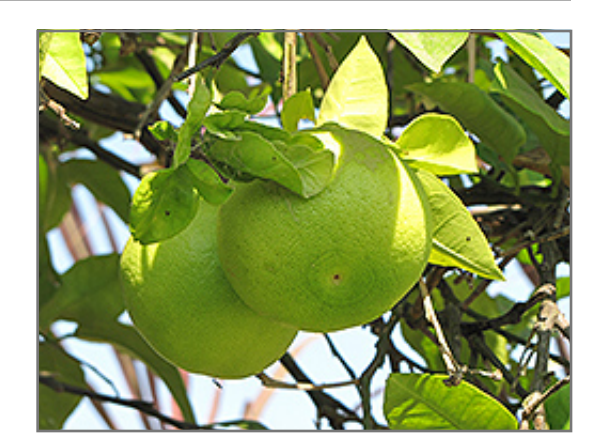
Oroblanco Grapefruit fruit

Aside from its primary use as an edible, Oroblanco Grapefruit is sutiable for the following landscape applications;