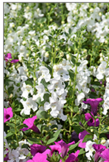
Alonia Snowball Angelonia flowers

This plant will require occasional maintenance and upkeep, and should not require much pruning, except when necessary, such as to remove dieback. It is a good choice for attracting bees and butterflies to your yard, but is not particularly attractive to deer who tend to leave it alone in favor of tastier treats. It has no significant negative characteristics.