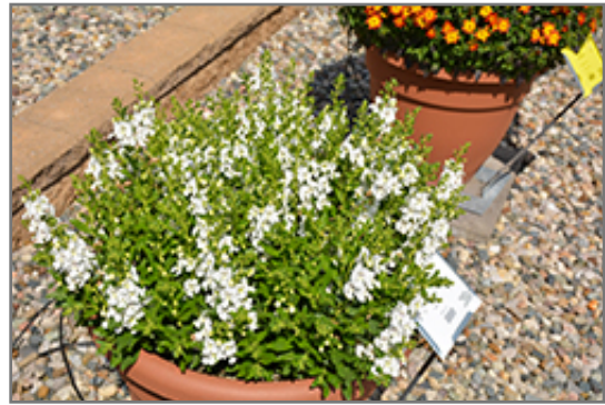
Alonia Snowball Angelonia in bloom

Alonia Snowball Angelonia is a fine choice for the garden, but it is also a good selection for planting in outdoor containers and hanging baskets. With its upright habit of growth, it is best suited for use as a 'thriller' in the 'spiller-thriller-filler' container combination; plant it near the center of the pot, surrounded by smaller plants and those that spill over the edges. Note that when growing plants in outdoor containers and baskets, they may require more frequent waterings than they would in the yard or garden.