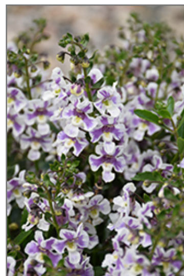
Alonia Bicolor Violet Angelonia flowers

Alonia Bicolor Violet Angelonia is recommended for the following landscape applications;