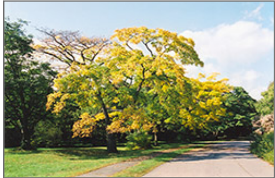
Amur Cork Tree in fall

This tree should only be grown in full sunlight. It is an amazingly adaptable plant, tolerating both dry conditions and even some standing water. It is not particular as to soil type or pH. It is somewhat tolerant of urban pollution. This species is not originally from North America.