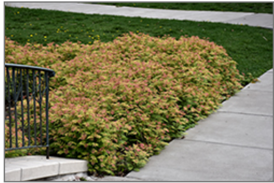
Mai Tai False Spirea

Mai Tai False Spirea makes a fine choice for the outdoor landscape, but it is also well-suited for use in outdoor pots and containers. Because of its height, it is often used as a 'thriller' in the 'spiller-thriller-filler' container combination; plant it near the center of the pot, surrounded by smaller plants and those that spill over the edges. It is even sizeable enough that it can be grown alone in a suitable container. Note that when grown in a container, it may not perform exactly as indicated on the tag - this is to be expected. Also note that when growing plants in outdoor containers and baskets, they may require more frequent waterings than they would in the yard or garden.