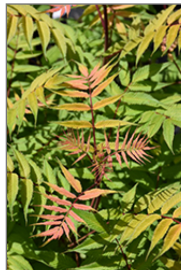
Mai Tai False Spirea foliage

Mai Tai False Spirea is recommended for the following landscape applications;