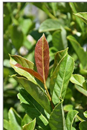
Sugar Cookie Sweet Viburnum foliage

This plant is not reliably hardy in our region, and certain restrictions may apply; contact the store for more information.