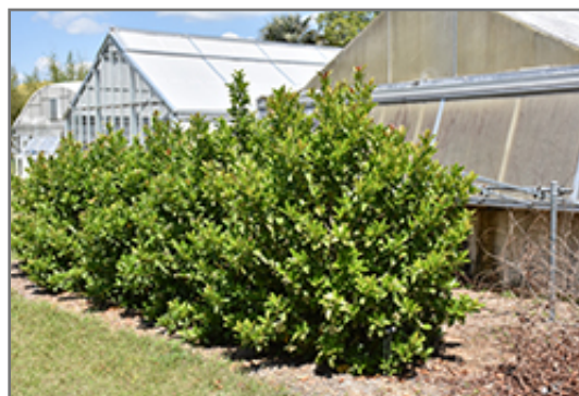
Sugar Cookie Sweet Viburnum