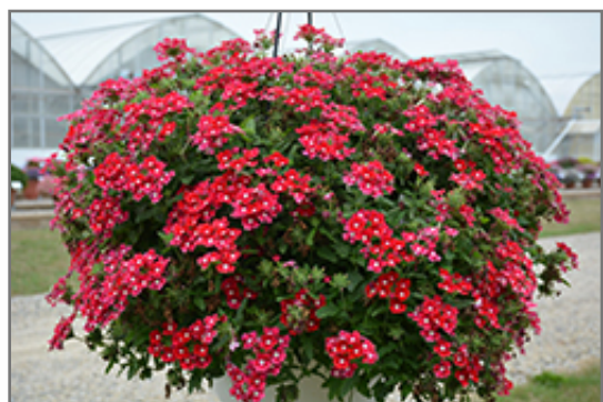
Cadet Upright Red Verbena in bloom