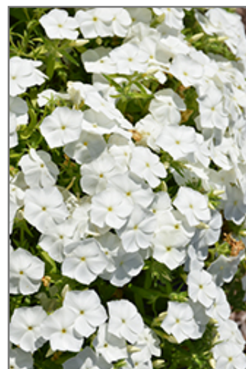
Gisele White Phlox flowers

Gisele White Phlox is recommended for the following landscape applications;