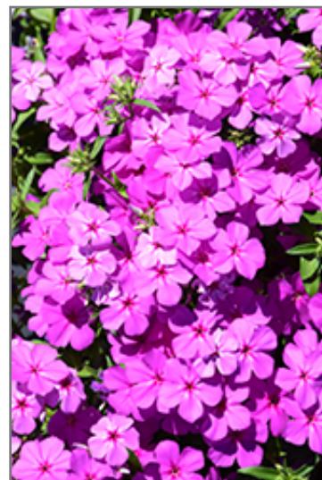
Gisele Violet Phlox flowers