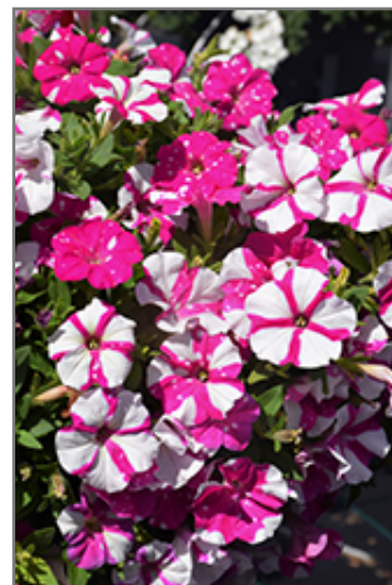
Headliner Pink Sky Petunia flowers