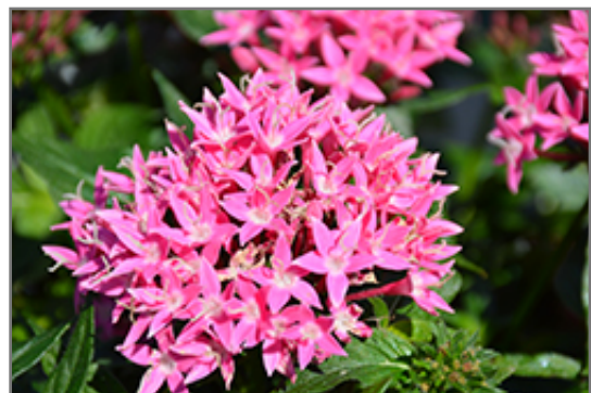
Lucky Star Deep Pink Star Flower flowers