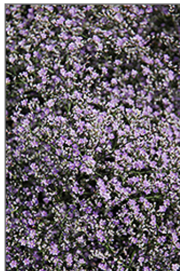
Sea Lavender flowers