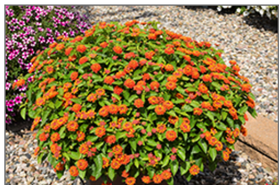
Hot Blooded Red Lantana in bloom