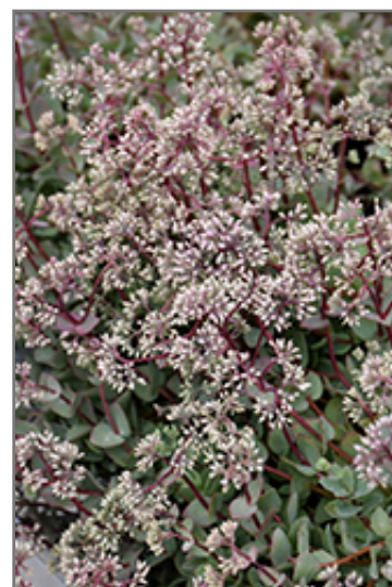
Pink Mongolian Stonecrop flowers

Pink Mongolian Stonecrop is recommended for the following landscape applications;