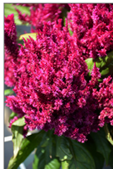
First Flame Purple Celosia flowers

First Flame Purple Celosia is recommended for the following landscape applications;