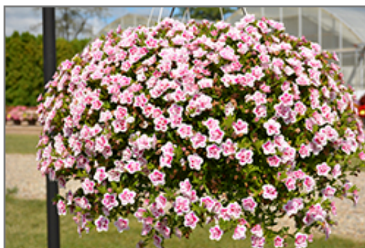
MiniFamous Uno Double PinkTastic Calibrachoa in bloom

MiniFamous Uno Double PinkTastic Calibrachoa is a fine choice for the garden, but it is also a good selection for planting in outdoor containers and hanging baskets. Because of its trailing habit of growth, it is ideally suited for use as a 'spiller' in the 'spiller-thriller-filler' container combination; plant it near the edges where it can spill gracefully over the pot. Note that when growing plants in outdoor containers and baskets, they may require more frequent waterings than they would in the yard or garden.