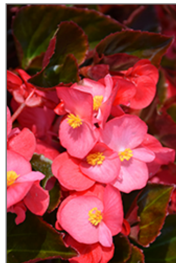
Viking Rose on Bronze Begonia flowers

Viking Rose on Bronze Begonia is recommended for the following landscape applications;