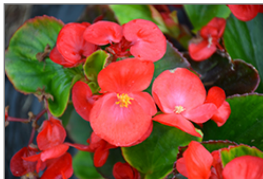
Topspin Scarlet Begonia flowers

Topspin Scarlet Begonia is recommended for the following landscape applications;