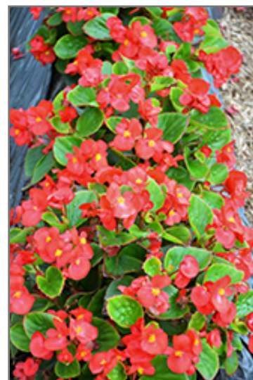
Topspin Scarlet Begonia in bloom