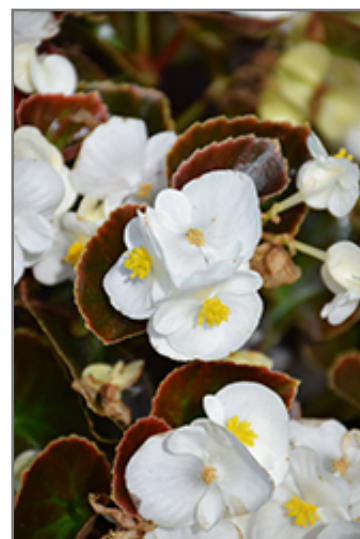
Senator IQ White flowers

Senator IQ White is recommended for the following landscape applications;