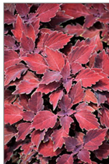
ColorBlaze Royale Cherry Brandy Coleus foliage