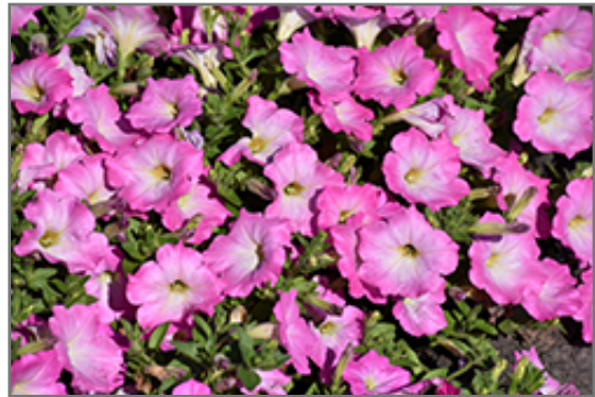
Opera Supreme Pink Morn Petunia flowers