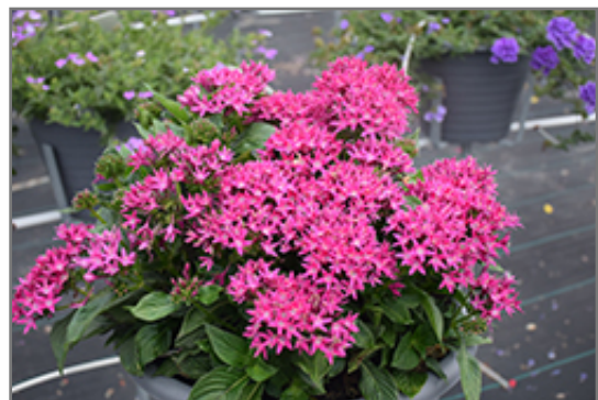
Sunstar Lavender Egyptian Star Flower in bloom