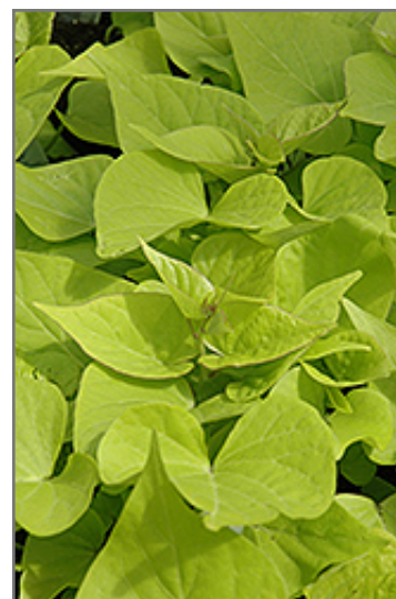
Sweet Caroline Sweetheart Light Green Sweet Potato Vine foliage

Sweet Caroline Sweetheart Light Green Sweet Potato Vine is recommended for the following landscape applications;