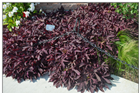
Sweet Caroline Red Hawk Sweet Potato Vine