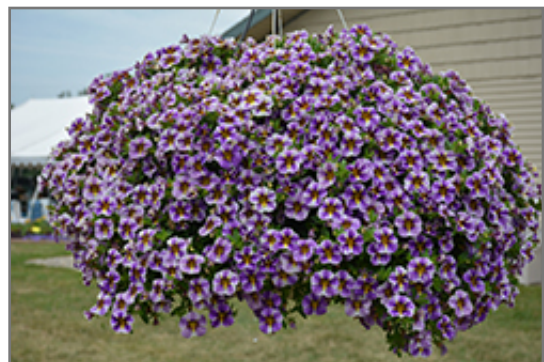
Superbells Holy Smokes! Calibrachoa in bloom