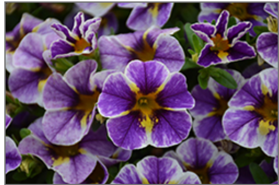
Superbells Holy Smokes! Calibrachoa flowers

This plant will require occasional maintenance and upkeep. Trim off the flower heads after they fade and die to encourage more blooms late into the season. It is a good choice for attracting bees and hummingbirds to your yard, but is not particularly attractive to deer who tend to leave it alone in favor of tastier treats. It has no significant negative characteristics.