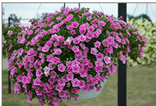
Superbells Doublette Love Swept Calibrachoa in bloom