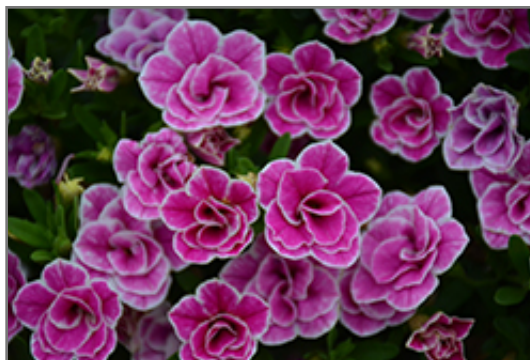
Superbells Doublette Love Swept Calibrachoa flowers

This plant will require occasional maintenance and upkeep. Trim off the flower heads after they fade and die to encourage more blooms late into the season. It is a good choice for attracting bees and hummingbirds to your yard, but is not particularly attractive to deer who tend to leave it alone in favor of tastier treats. It has no significant negative characteristics.