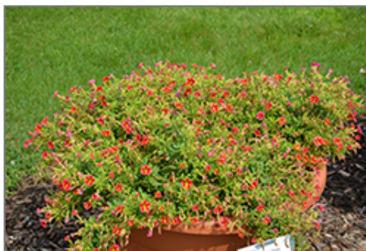
Superbells Cardinal Star Calibrachoa in bloom