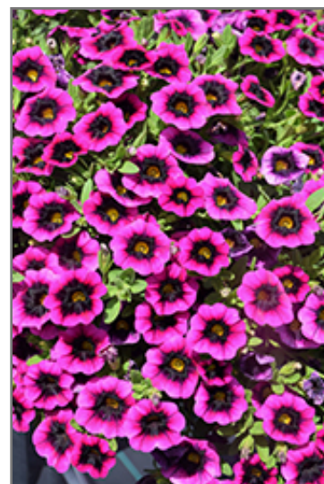
Superbells Blackcurrent Punch Calibrachoa flowers

Superbells Blackcurrent Punch Calibrachoa is recommended for the following landscape applications;