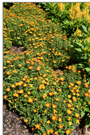
Campfire Flame Bidens in bloom