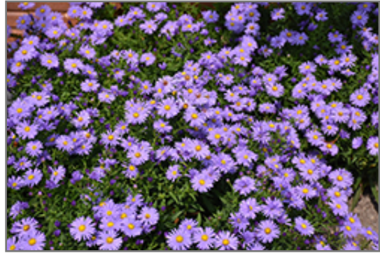
Romany Aster flowers

Romany Aster will grow to be about 16 inches tall at maturity, with a spread of 16 inches. Its foliage tends to remain dense right to the ground, not requiring facer plants in front. It grows at a medium rate, and under ideal conditions can be expected to live for approximately 10 years. As an herbaceous perennial, this plant will usually die back to the crown each winter, and will regrow from the base each spring. Be careful not to disturb the crown in late winter when it may not be readily seen!