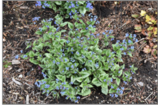
Queen of Hearts Bugloss in bloom

Queen of Hearts Bugloss will grow to be about 18 inches tall at maturity extending to 30 inches tall with the flowers, with a spread of 3 feet. When grown in masses or used as a bedding plant, individual plants should be spaced approximately 30 inches apart. It grows at a medium rate, and under ideal conditions can be expected to live for approximately 10 years. As an herbaceous perennial, this plant will usually die back to the crown each winter, and will regrow from the base each spring. Be careful not to disturb the crown in late winter when it may not be readily seen!