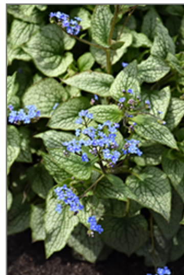
Queen of Hearts Bugloss flowers