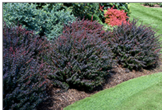
Sunjoy Mini Maroon Japanese Barberry

Sunjoy Mini Maroon Japanese Barberry is recommended for the following landscape applications;