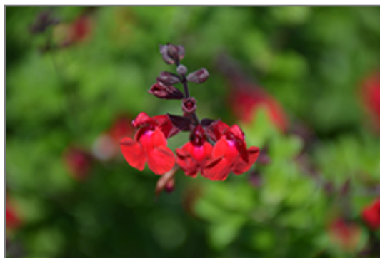
Flame Autumn Sage flowers