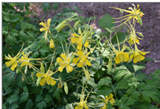
Texas Gold Columbine flowers

Texas Gold Columbine is recommended for the following landscape applications;