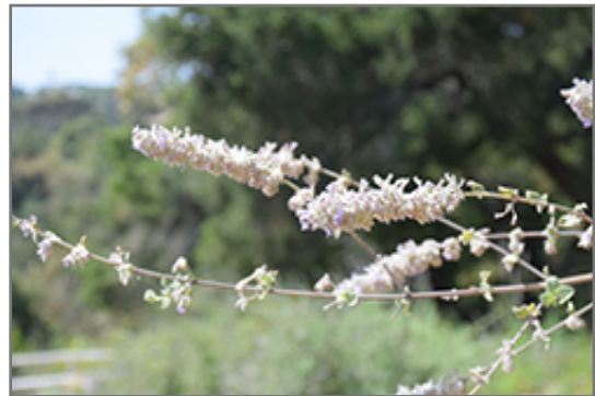
Desert Lavender flowers