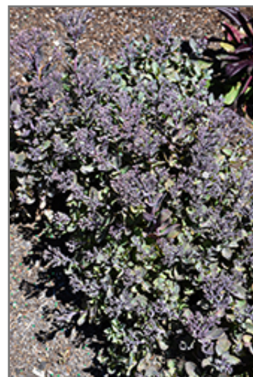
Dynomite Stonecrop in bloom