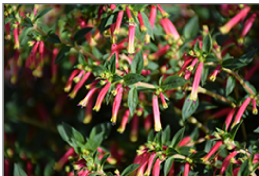
Honeybells Cuphea flowers