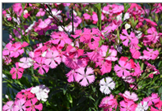
Rockin' Pink Magic Pinks flowers