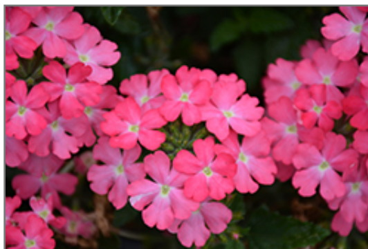
Firehouse Pink Verbena flowers