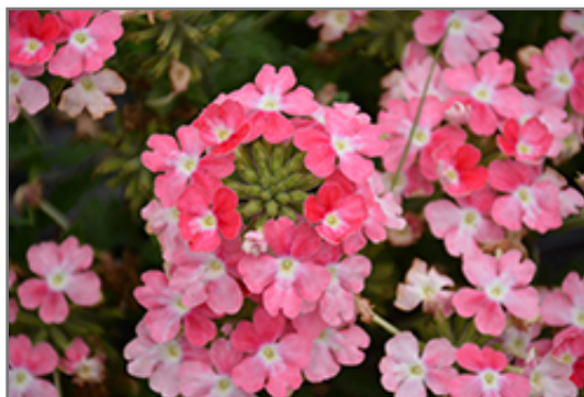
EnduraScape Pink Fizz Verbena flowers