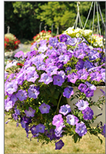
Easy Wave Lavender Sky Blue Petunia in bloom

Easy Wave Lavender Sky Blue Petunia is a fine choice for the garden, but it is also a good selection for planting in outdoor containers and hanging baskets. Because of its trailing habit of growth, it is ideally suited for use as a 'spiller' in the 'spiller-thriller-filler' container combination; plant it near the edges where it can spill gracefully over the pot. Note that when growing plants in outdoor containers and baskets, they may require more frequent waterings than they would in the yard or garden.