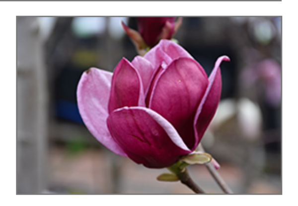
Genie Magnolia flowers