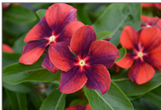
Tattoo Tangerine Vinca flowers