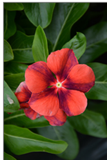
Tattoo Tangerine Vinca flowers

Tattoo Tangerine Vinca is recommended for the following landscape applications;