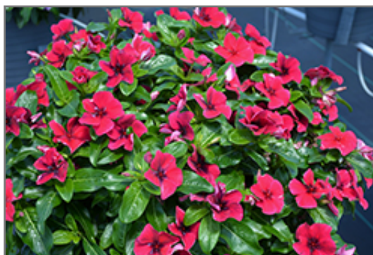
Tattoo Black Cherry Vinca in bloom