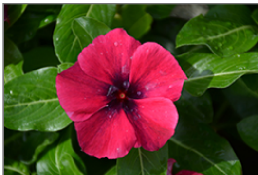
Tattoo Black Cherry Vinca flowers

Tattoo Black Cherry Vinca is recommended for the following landscape applications;