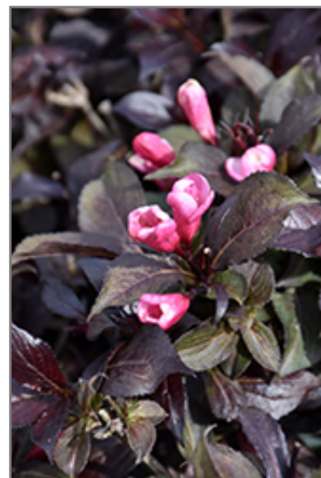
Coco Krunch Weigela flowers