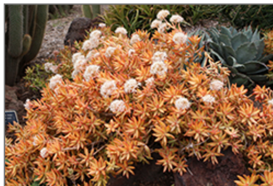
Firestorm Stonecrop in bloom

Firestorm Stonecrop is recommended for the following landscape applications;